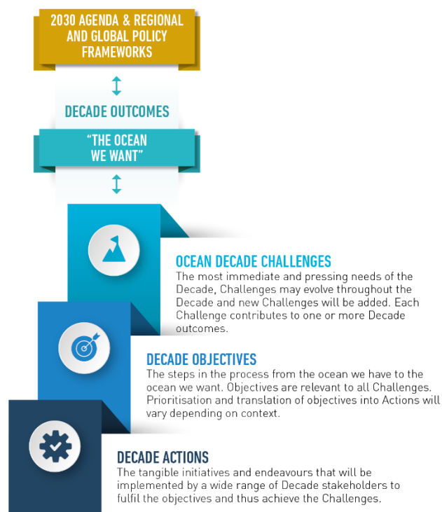
Figure 1: Ocean Decade Action Framework

The Ocean Decade Implementation Plan will guide the operationalisation of the Ocean Decade over the next 10 years. The Plan describes the desired characteristics of the 'ocean we want' via a series of seven Decade Outcomes. The Plan provides a non-prescriptive framework for diverse stakeholders to collaborate in the design of Decade Actions and delivery of results that will be organised around a series of Decade Objectives, and implemented to address a series of ten Ocean Decade Challenges, which represent the most pressing and immediate priorities for the Decade (refer Figure 1).