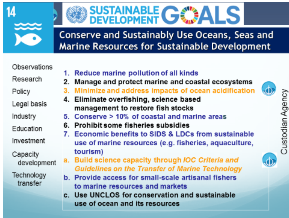
Figure 2. Sustainable Development Goal 14