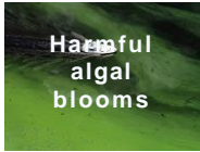
Harmful algal blooms