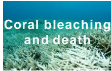
Coral bleaching and death