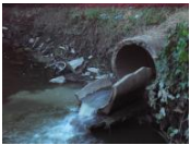
Grey water- from sinks and drains