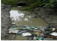
Garbage from gullies and rivers