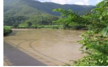
Sedimentation including Mining & Industry