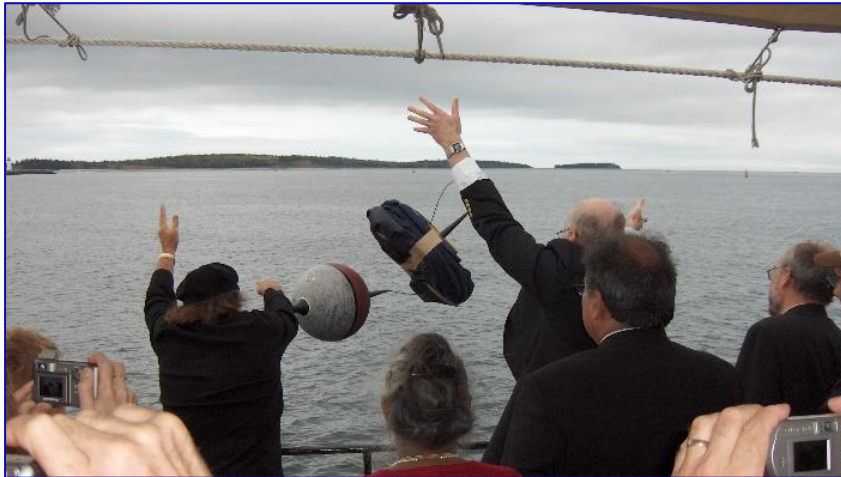
Figure 2. Meeting the GOOS network design target - the launch of the Global Drifter Program's 1250 th drifter on 18 September 2005, deployed in the ocean off Halifax, Nova Scotia, Canada.

The DBCP will continue to play a leading role - in close partnership with the scientific and operational global ocean observing community 1 and its user communities - in helping to realize key elements of the World Meteorological Organization (WMO) 2040 vision for the global observing system, the Intergovernmental Oceanographic Commission (IOC) of UNESCO (United Nations Educational, Scientific and Cultural Organization)-led UN Decade of Ocean Science for Sustainable Development, the GOOS 2030 Strategy and much more.