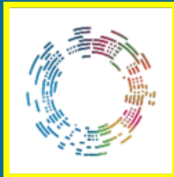
Sustainable Ocean Planning