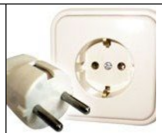
Type F: This socket also works with plug C and E.