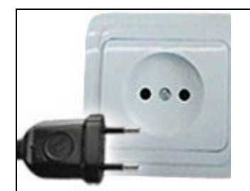
Type C: This socket also works with plug E and F.

The standard voltage throughout Indonesia is normally 230 Volt and with a standard frequency of 50 Hz. Most power plugs and sockets in Indonesia are type C and F, as below. If you're coming from a country that does not use this type of sockets, you should bring an adapter.