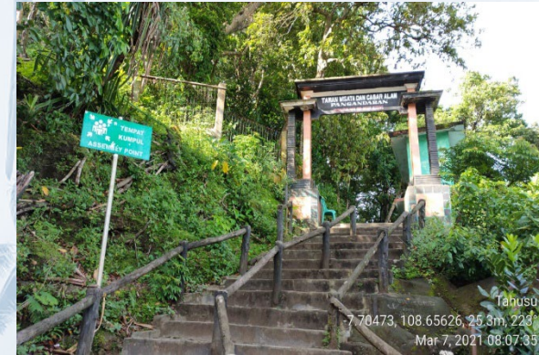
Pangandaran Nature Reserve,

The Pangandaran village has a tsunami evacuation shelters located in the tourist market with a capacity of 3,000 people and the Pangandaran Grand Mosque with a capacity of 1,000 people .