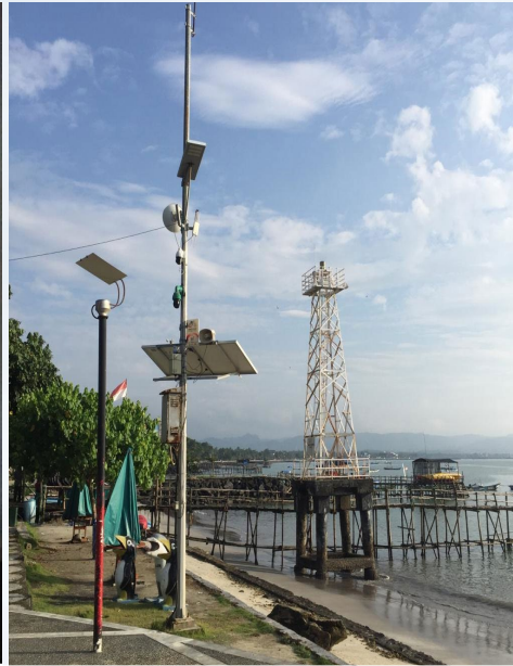
CCTV at four locations