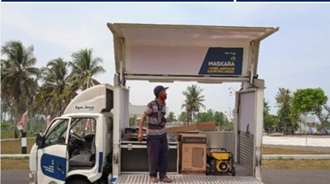
The Champion Village Aspiration Mini Van (MASKARA)