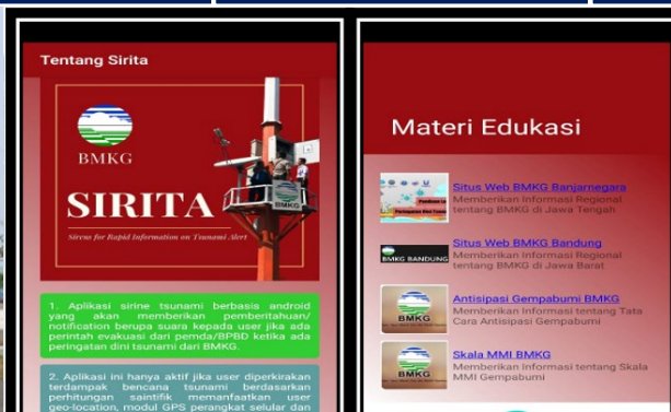
SIRITA (Sirens For Rapid Information on Tsunami Alert)