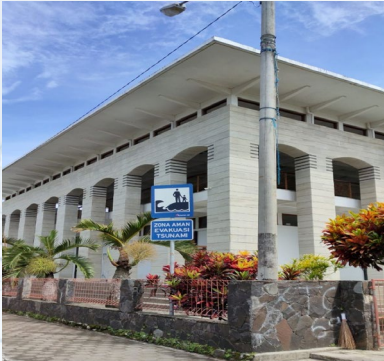
Pangandaran Grand Mosque

Five hotels, the Horison Hotel, Laut Biru Hotel, Hotel d'Bilz, Pantai Indah Hotel, and Fortuna Hotel have Memorandum of Understanding ( MoU ) with the village government as tsunami evacuation place. The five hotels have a capacity of 750 people