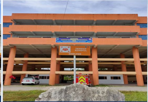
Shelter at Tourist Market

The Pangandaran village has a tsunami evacuation shelters located in the tourist market with a capacity of 3,000 people and the Pangandaran Grand Mosque with a capacity of 1,000 people .