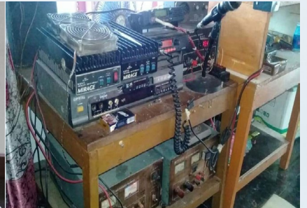
ORARI Amateur Radio Device