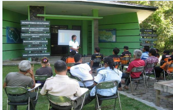
Earthquake and tsunami socialisation for nature reserve tour guides