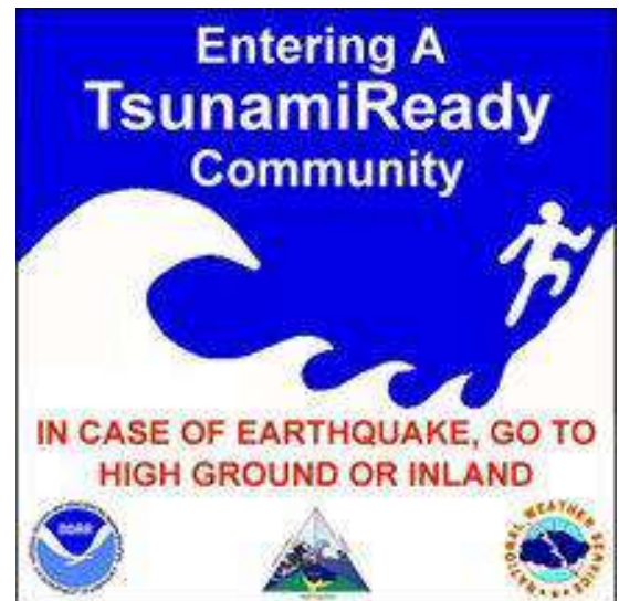
Figure 26. Entering a TsunamiReady® Community signboard in US.

The primary users of the Tsunami Ready Guidelines are local authorities of coastal communities at risk of tsunami impact, as well as representatives of Emergency Management Agencies or Disaster Management Offices working with coastal communities facing risk of tsunami impact.