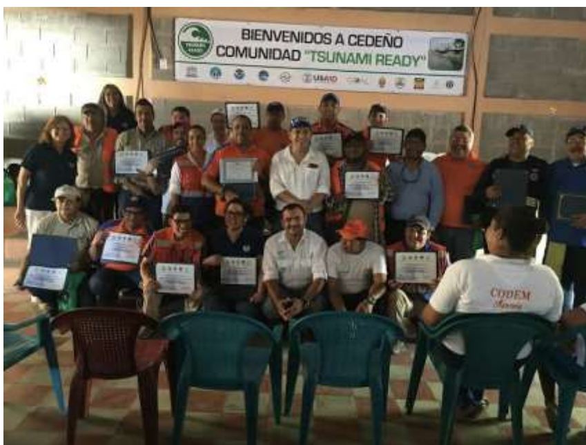
Figure 27. Tsunami ready recognition ceremony of the Cedeño community in Honduras.

It is important to consider that Tsunami Ready recognition is not a certification of readiness. Tsunami Ready recognition appreciates and acknowledges the community that has built their capacity and implemented measures in accordance with the agreed indicators of the Tsunami Ready Recognition Programme.