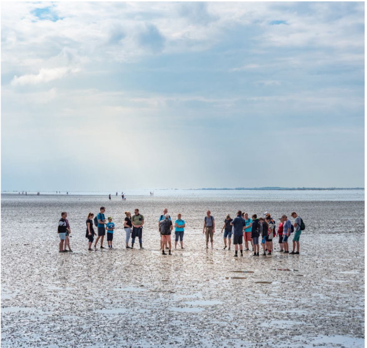
Bensersiel, Germany