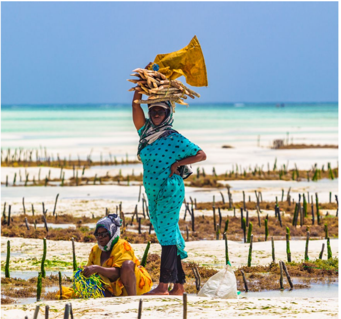
Jambiani, Zanzibar, Tanzania