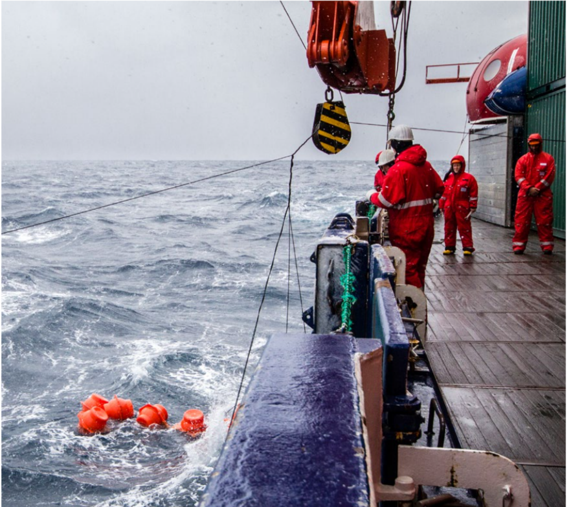
Weddell Sea, Antarctica

IIOC Regional Subsidiary Bodies] are the most efficient platforms for co-designing and co-delivering IOC capacity development activities with Member States, leaving no one behind.