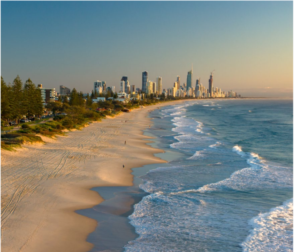
Gold Coast City, Queensland, Australia

The role of IOC will only continue to increase in the future, because maintaining vital life-support functions of the ocean is becoming more and more science-intensive.