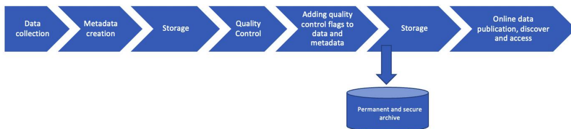
Figure 2: Data flow diagram for delayed-mode data

It is worth mentioning that specific IOC programmes or projects may have specific data flow arrangements as well, including specific outputs (data/information products and services).