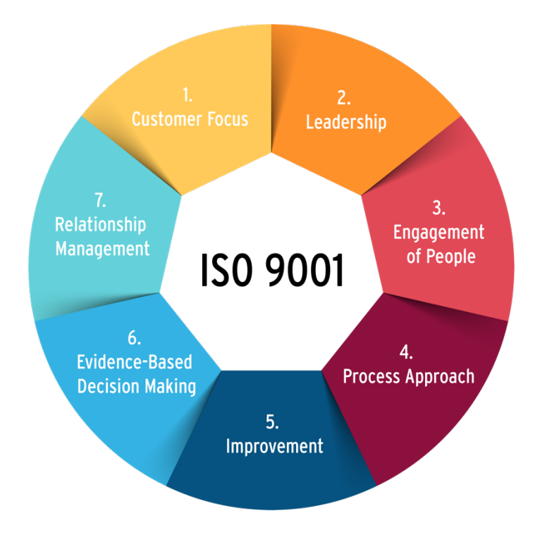
Figure 2. ISO 9001 Quality Management Principles

ISO 9001:2015 is based on these seven quality management principles which are designed to aid performance improvement.