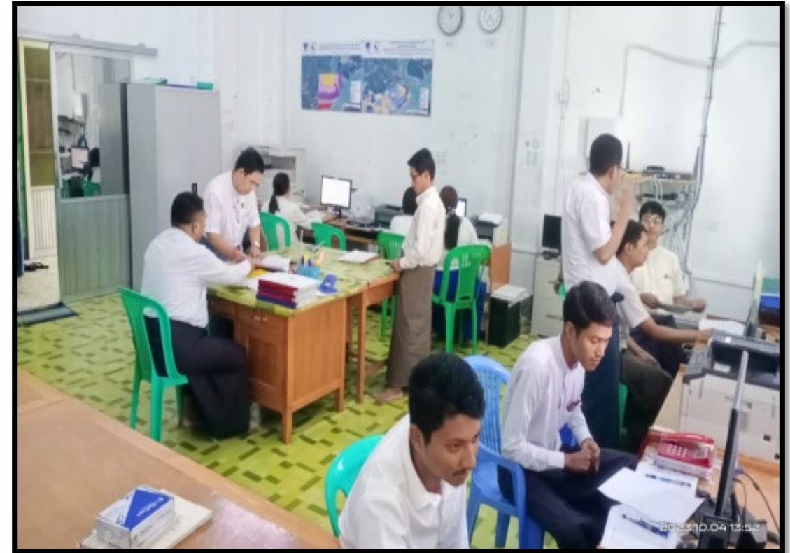
Receiving and Disseminating Warning Messages at IOWave 23 Exercise