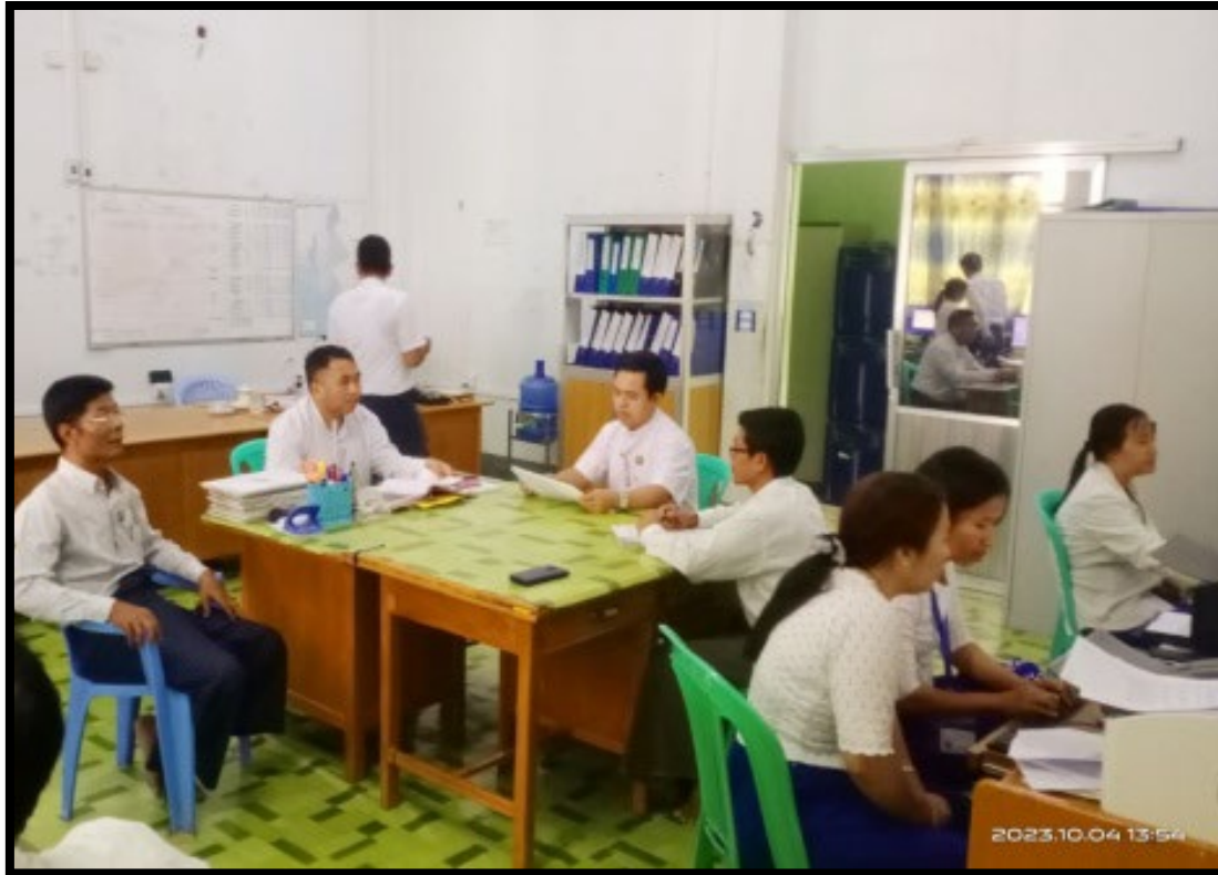
Conducting Communication Exercise at IOWave 23 Exercise