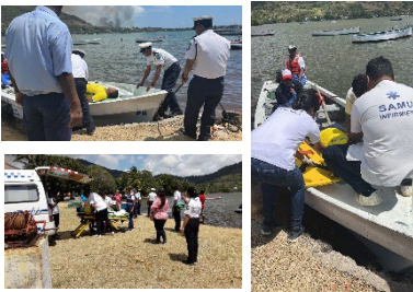
Evacuation exercise at Quatre-Soeurs Village, South-East of Mauritius

National Crisis Committee, under the chairperson of the Hon. Vice Prime Minister, Minister responsible for Disaster Risk Management, met at 10h00 to take cognizance of the situation and to take timely decisions regarding evacuation of vulnerable coastal areas.