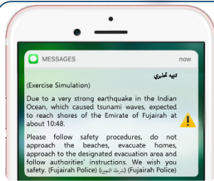
Figure 1. Example of the warning messages and evacuation call received by the public from warning system of lead agency (MOI).