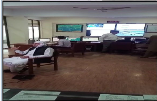
Engage National Media Through Press releases & Main Stream Media Cover whole Exercise