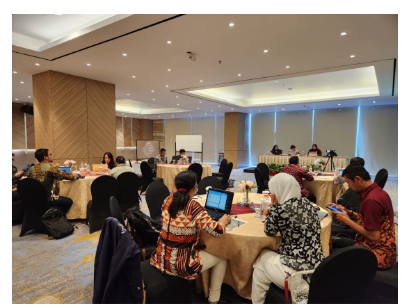
8 December 2023