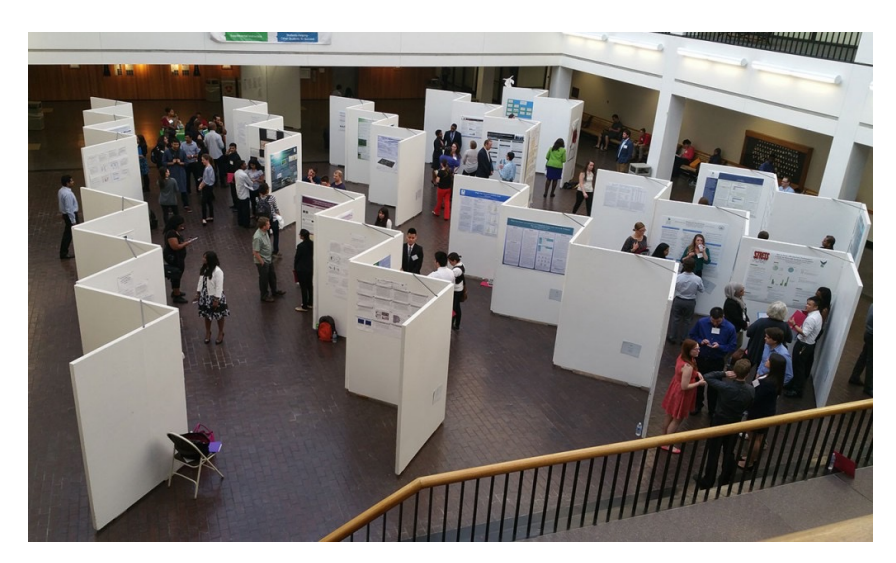
3. Poster Session: open to public to participate for Global Tsunami Symposium