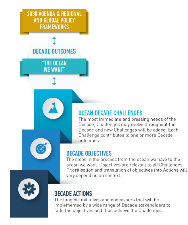
Figure 1: Ocean Decade Action Framework

The <u>Ocean Decade Implementation Plan</u> will guide the operationalisation of the Ocean Decade over the next 10 years. The Plan describes the desired characteristics of the 'ocean we want' via a series of seven Decade Outcomes. The Plan provides a non-prescriptive framework for diverse stakeholders to collaborate in the design of Decade Actions and delivery of results that will be organised around a series of Decade Objectives, and implemented to address a series of ten Ocean Decade Challenges, which represent the most pressing and immediate priorities for the Decade (refer Figure 1).