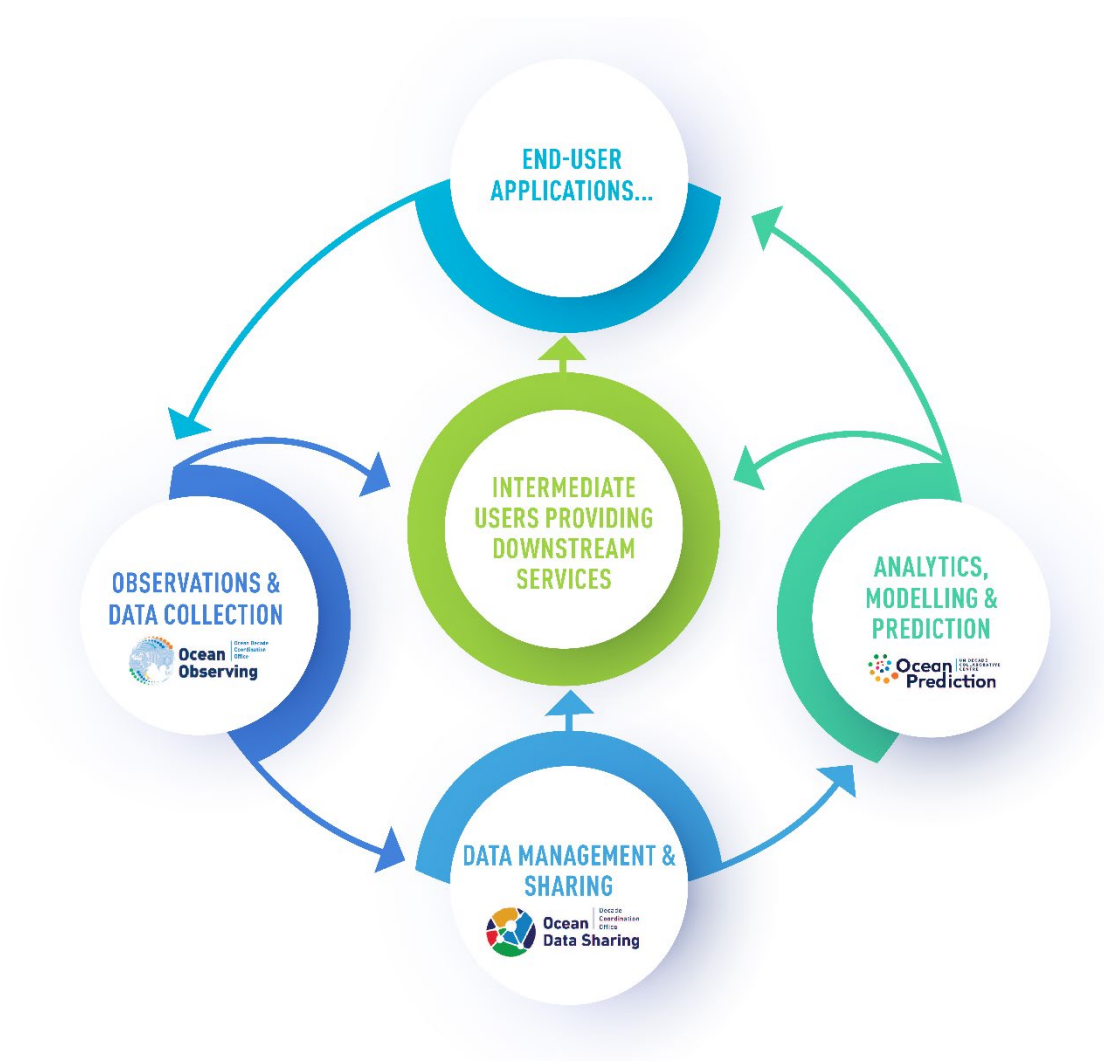
Figure 1. Main components of the ocean digital ecosystem and associated Ocean Decade coordination bodies