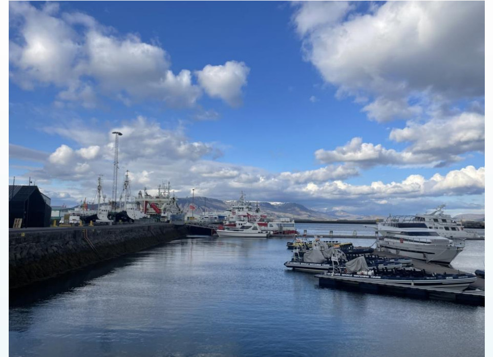
Launch of the StOR, 3 June, Iceland