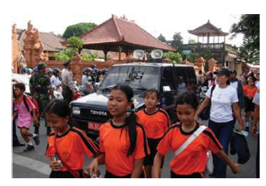
Bali school children follow a designated tsunami evacuation route as part of an Indonesian Tsunami Drill, December 2006

Some 1000 – 2000 school children and teachers were observed participating in the drill. The drill was conducted based on the recommendation of IOC Indonesia Tsunami Roundtable in May 2006. Since then, similar drills have occurred annually on