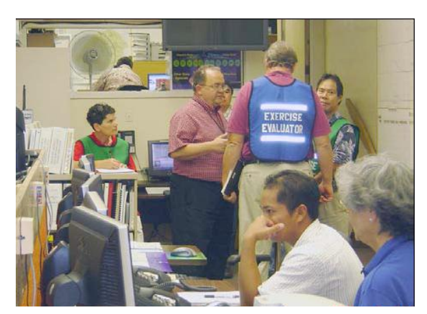
Functional style Tsunami Exercise conducted at Hawaii State Civil Defense - Emergency Operating Centre, circa 2003.

The State of Hawaii, USA conducts two functional, command post style tsunami exercises annually, using local and distant tsunami scenarios. The Pacific Tsunami Warning Centre customizes tsunami scenarios for the Hawaii State Civil Defense, the lead state disaster coordination agency. Multiple federal, state, county government agencies, private sector organizations and NGO's test their 24/7 emergency communications and simulate enabling Tsunami Emergency Response – Standard Operating Procedures.