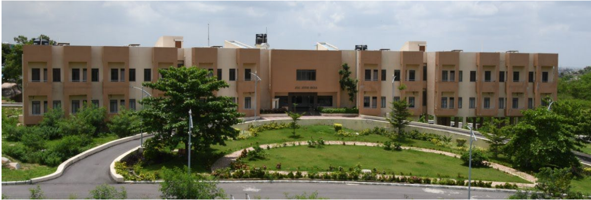
ITCOcean Guest House