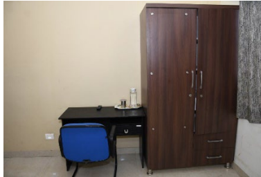
Study Table and Wardrobe