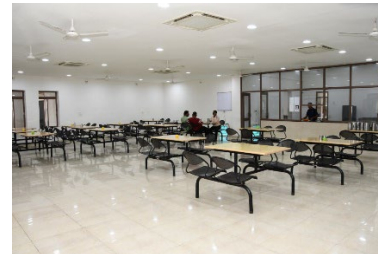
Common dining area