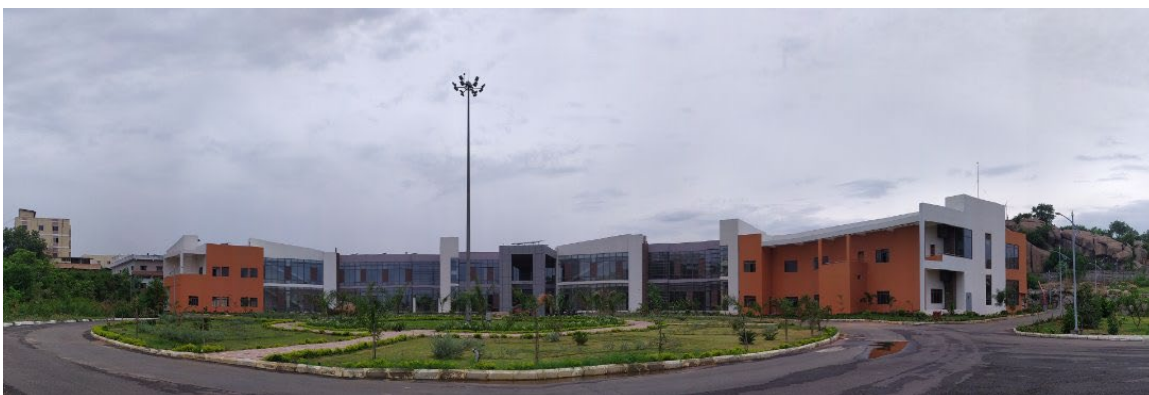
ITCOOcean Training Facilities

INCOIS will keep a car available at the guest house for use by the participants, should there be a need to visit the city for medical and other supplies. An attendant will be available at the guest house reception on a 24 x 7 basis to cater to any requests from the guests.