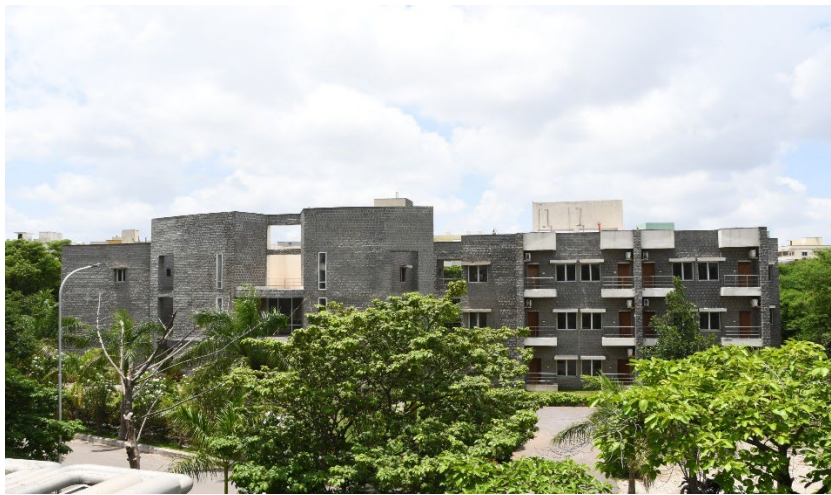
INCOIS Guest House