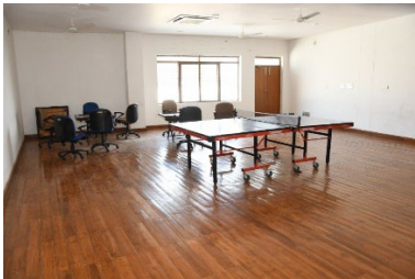
Table Tennis facility