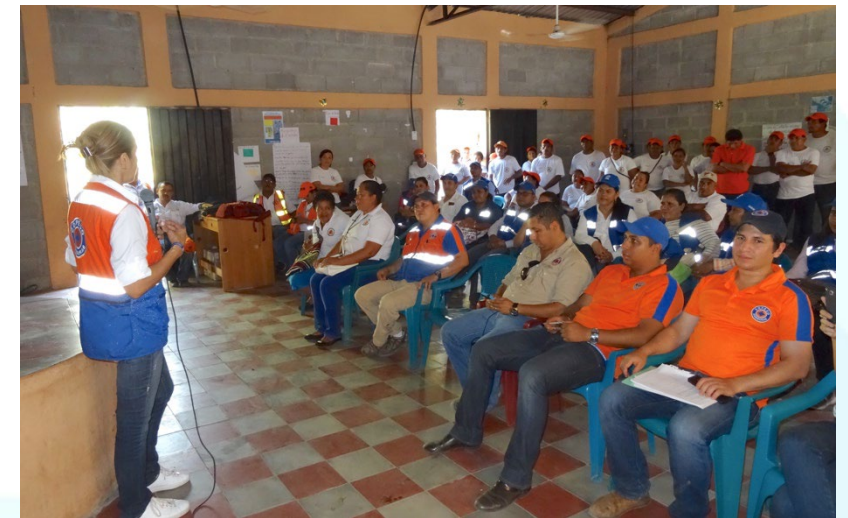
Cedeño, Honduras, Tsunami Ready Recognition Ceremony, February 2017.