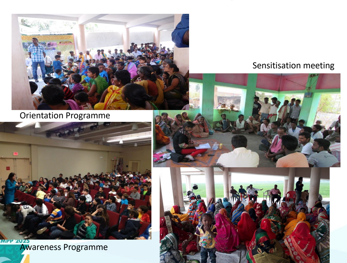
The community should have outreach and educational activities: