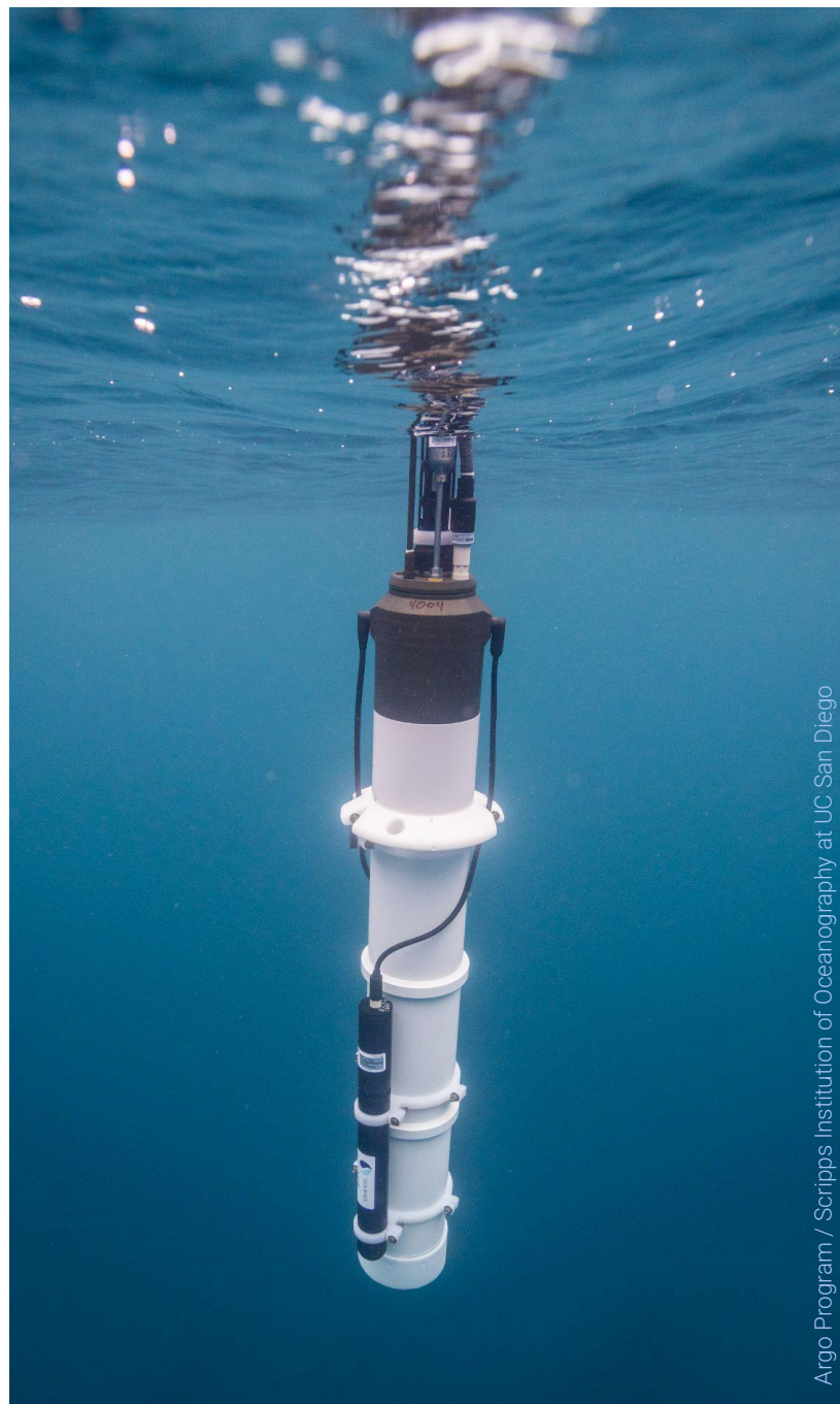
Argo Program / Scripps Institution of Oceanography at UC San Diego