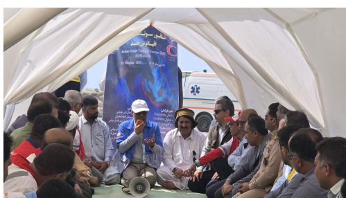
In-filed meeting for last organizing exercise.