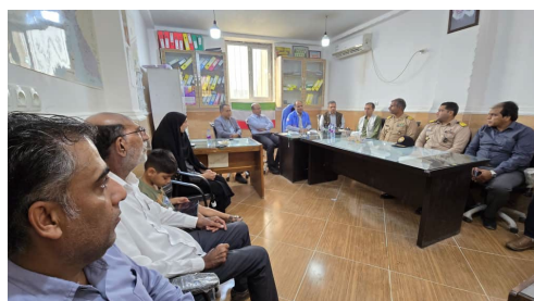
Pre-meeting for organizing exercise.