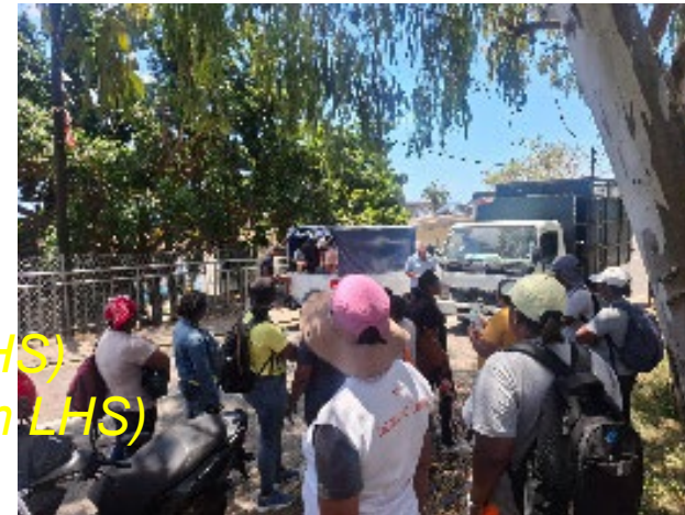
NCG in communication with community (top LHS) NCG moving around in vehicle to other villages (Top RHS) Community being given information to evacuate (bottom LHS) Community evacuating (bottom RHS)